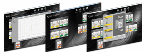
DEGA VISIO III visualization software