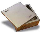
Cover for transmitter NB III LCD stainless steel 316