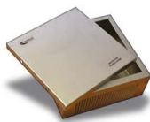
Cover for transmitter NS II LCD - Stainless steel 316